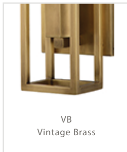
VB Vintage Brass