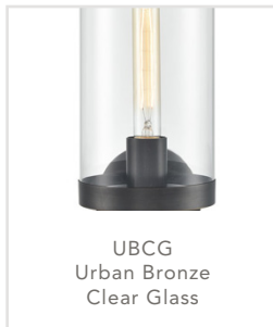
UBCG Urban Bronze Clear Glass