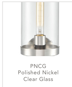
PNCG Polished Nickel Clear Glass

*For complete warranty terms, please visit: www.aloralighting.com/warranty