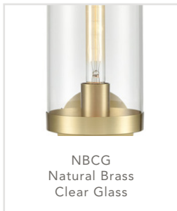
NBCG Natural Brass Clear Glass