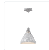
PD584510SL Steel Shade

*For complete warranty terms, please visit: www.aloralighting.com/warranty