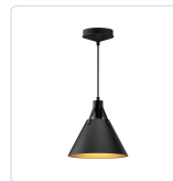
PD584510MB Matte Black