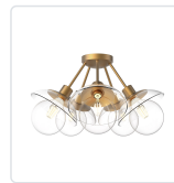
SF517220AGCL Aged Gold/Clear Glass