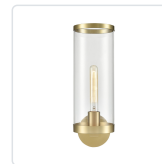
WV311601NBCG Clear Glass/Natural Brass