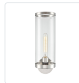
WV311601PNCG Clear Glass/Polished Nickel